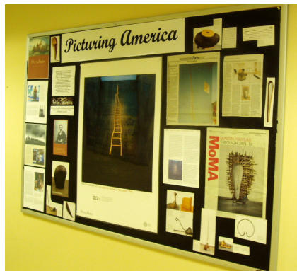
Bulletin board featuring Puryear's "Ladder for Booker T. Washington"

the Humanities (NEH). The grant provides 20 double-sided laminated posters (received in February 2008) with reproductions of masterpieces by American painters, photogra-