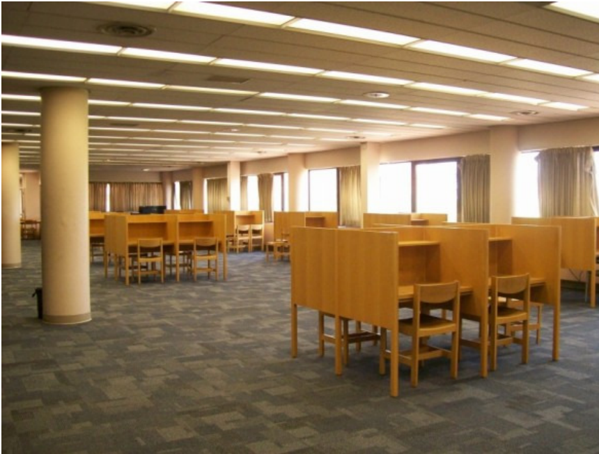
G-Wing Study Area